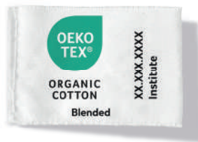
Minimum 70 % Organic cotton

Mixtures of organic and conventional cotton are forbidden.