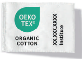
100 % Organic cotton

Two types of certification are available depending on the percentage of organic cotton: